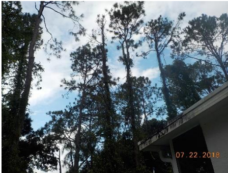
Home threatened by dead pines

The dead pines are breaking off and falling, due to the close proximity of the homes and private property, many are in the fall zone.