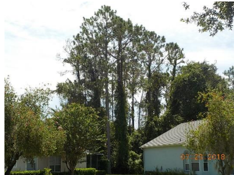
Pines in close proximity to homes