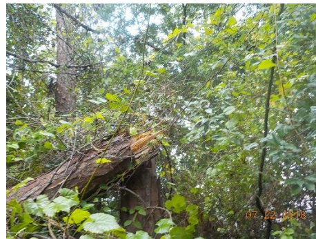
Broken Pine trunk