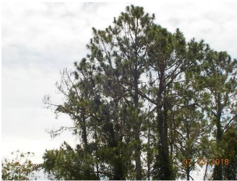
Pines infected with Diplodia